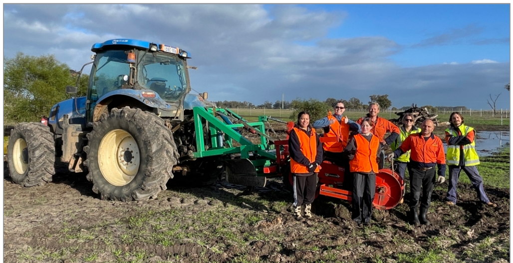
MECHANICAL SEED PLANTING UNDERTAKEN BY THE CAPEWEST TEAM

The Company is also seeking to extend its operations to both the north and south of Lot 63, comprising of both private and Doral owned land, with some sections also previously mined, which we refer to as the western extension.