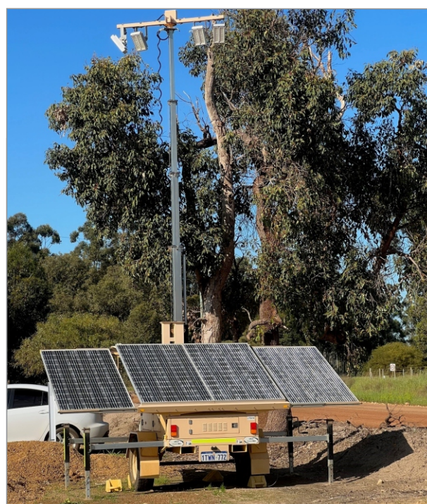
SOLAR GENERATED LIGHTING TOWER AT KEYSBROOK