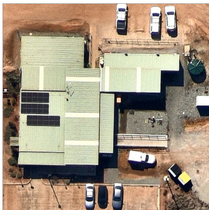
ROOFTOP SOLAR PANELS AT KEYSBROOK ADMINISTRATION