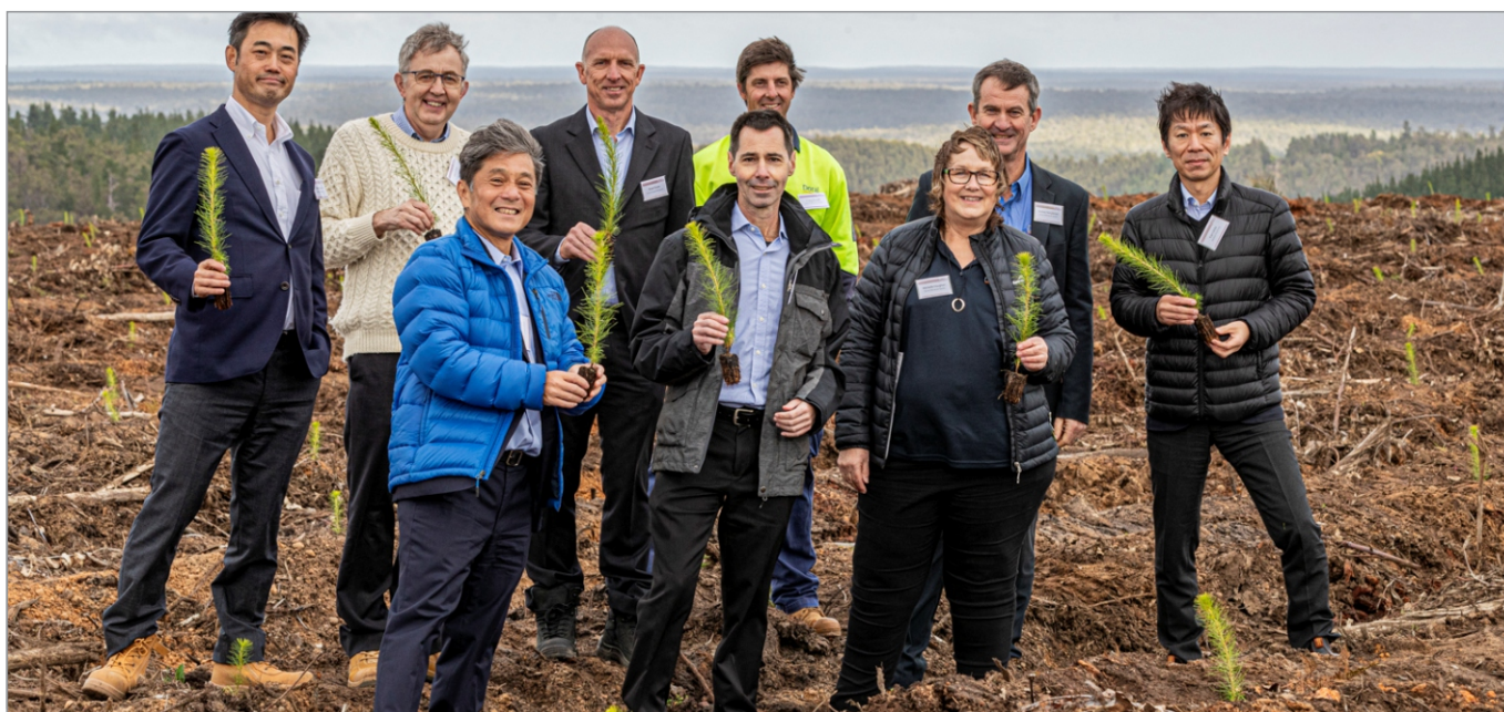
IWATANI CELEBRATING INAUGURAL PINE SEEDLING PLANTING EVENT

In addition, the Keysbrook site continues to utilise solar generated lighting towers at the administration car park and Mine Feed Unit location.